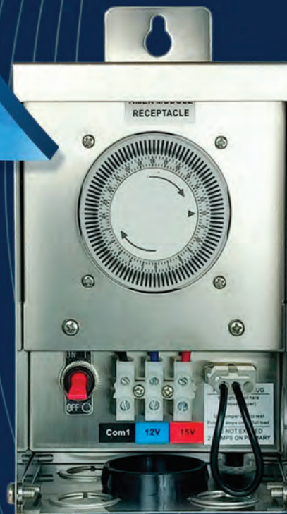
BUILT-IN MECHANICAL TIMER!