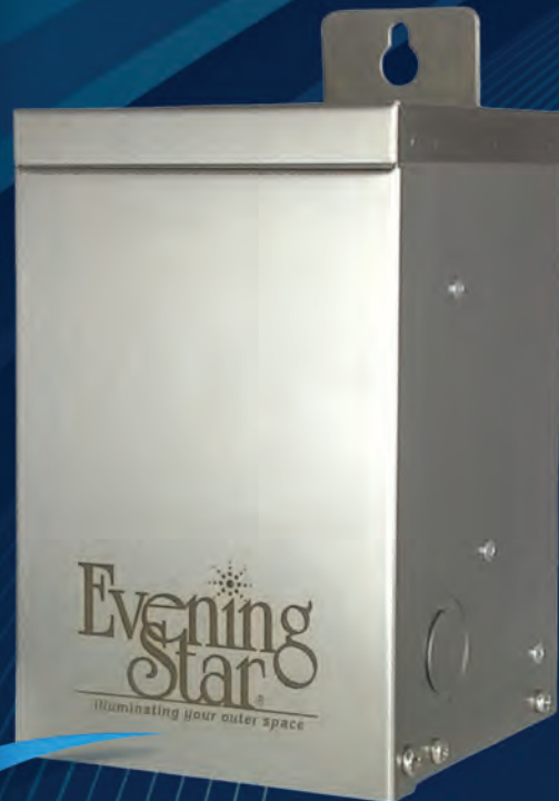
EVENING STAR 75 WATT STAINLESS STEEL TRANSFORMER